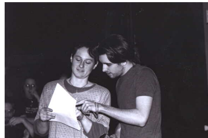
No Shame

Where anything can happen... and usually does!